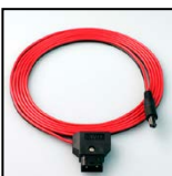
P-TAP 1000 Use with a standard battery P-TAP power source.

The kit includes an AC power supplies. The power adapters below are optional.