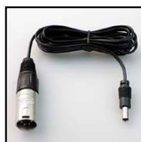
XLR 1000 Use with a standard 4 pin XLR camera battery power source.

*Distance is an approximation. Actual distances achieved can be longer or shorter depending on the type of cable. Determine link losses and perform optical budget calculations to ensure correct operation.