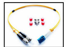
Model# LC/FC DUP LC/PC to FC/PC Adapter