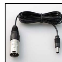
XLR 1000 Use with a standard 4 pin XLR camera battery power source.