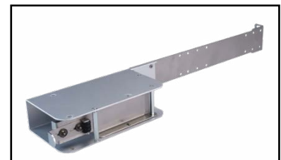
RXT 1001: Power Supply Holder