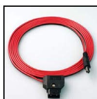
P-TAP 1000 Use with a standard battery P-TAP power source.

Note: This does not replace the included power supply.