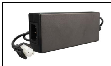
RPS A100: 100W Power supply