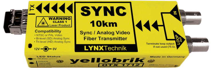
OTX 1712 LC Version Shown

The OTX 1712 provides a passive loop output and support for LC, ST or SC singlemode fiber connections. An LC version suitable for multimode fiber is also available.