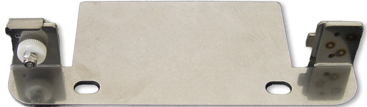
Bracket shown mounted on 19" rack rails

No tools are required for module installation and removal, this is accomplished using a nylon thumbscrew.