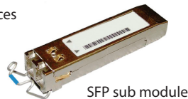
SFP sub module

All other fiber options are LC connections