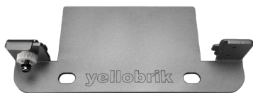
RFR 1001 Mounting Bracket for a single yellobrik.