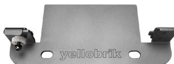
RFR 1001 Mounting Bracket for a single yellobrik.