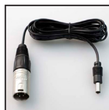
XLR 1000 Use with a standard 4 pin XLR camera battery power source.