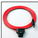
P-TAP 1000 Use with a standard battery P-TAP power source.

The kit INCLUDES AC power supplies. The power adapters below are optional.