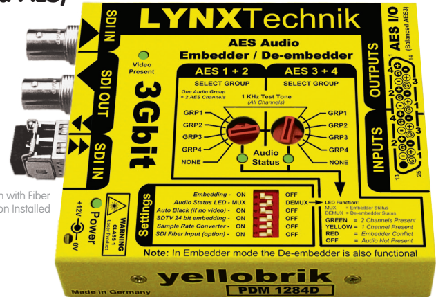
Shown with Fiber SFP Option Installed

The "auto black" mode uses a black video frame if no SDI input is present. This allows the module to embed audio even when no video source is available. This mode is useful if the module is being used in an "audio only" application. A 1 kHz test tone generator is included for audio testing purposes.