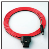
P-TAP 1000 Use with a standard battery P-TAP power source.

The kit INCLUDES AC power supply. The power adapters below are optional.