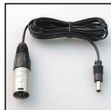
XLR 1000 Use with a standard 4 pin XLR camera battery power source.