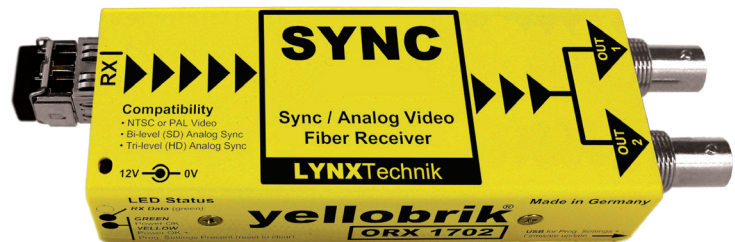
ORX 1702 LC Version Shown

The ORX 1702 provides two analog outputs and support for LC, ST or SC singlemode fiber connections. An LC version suitable for multimode fiber is also available.